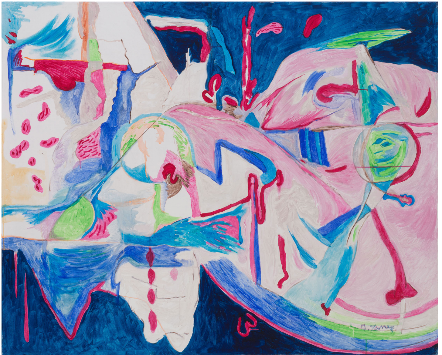
The Tears of Arctic Fox