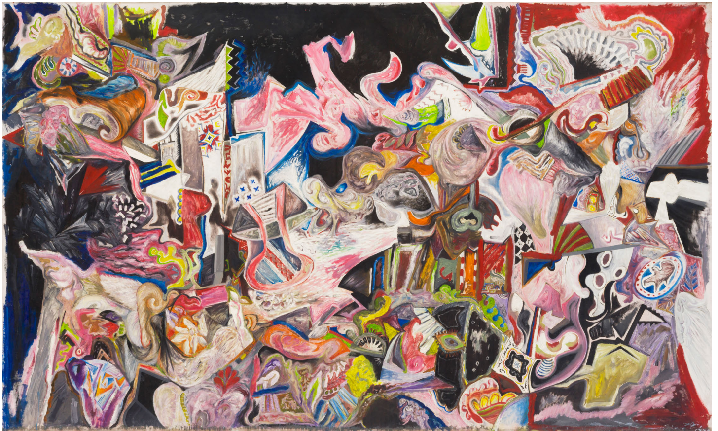
The Unlucky Romantic 2017 Oil on canvas 2080 x 3530 mm