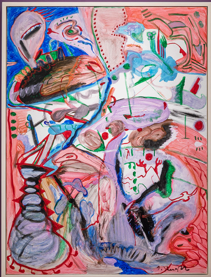
牡蛎之歌 Song of the Oyster 1200 × 1500 mm 布面油画、丙烯 Oil and acrylic on canvas