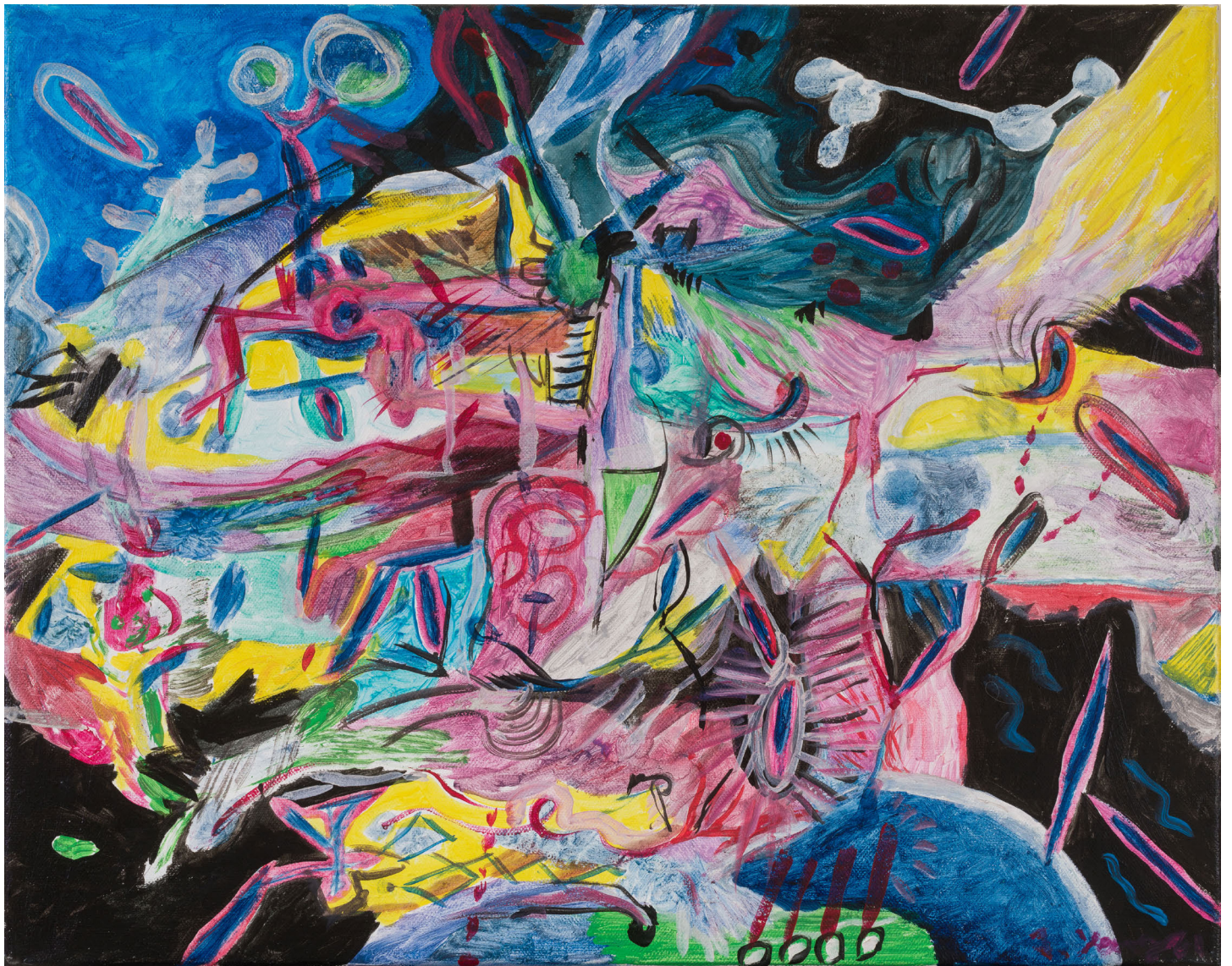
Wandering in the Summer Night 2021 Oil and acrylic on canvas 500 x 600 mm