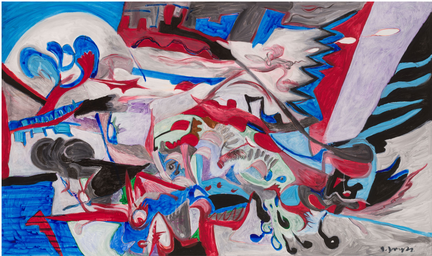
The Great String/ The Power of Revolution 2022 Acrylic on canvas 1200 x 2000 mm