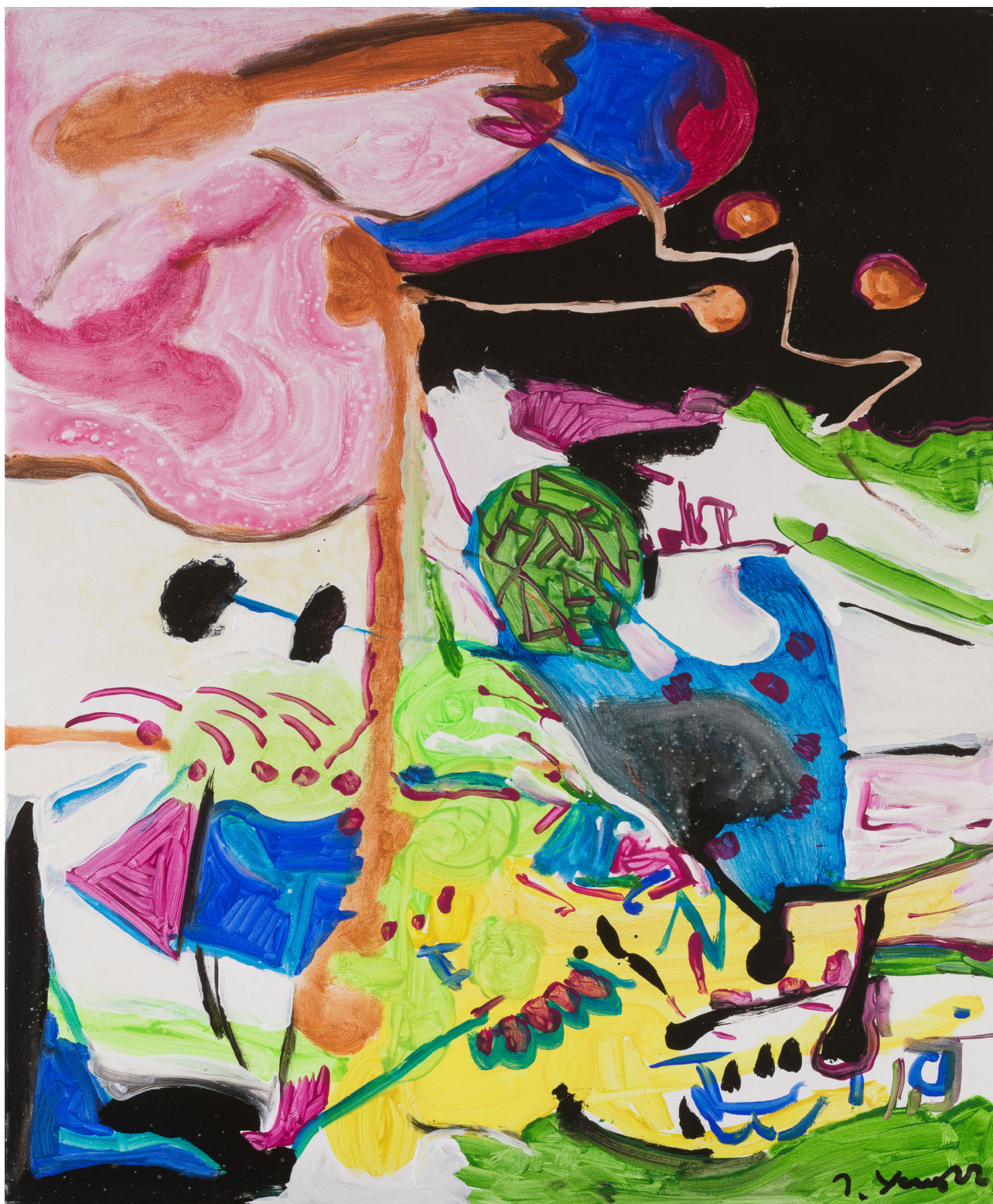
A Night on Ivory Island