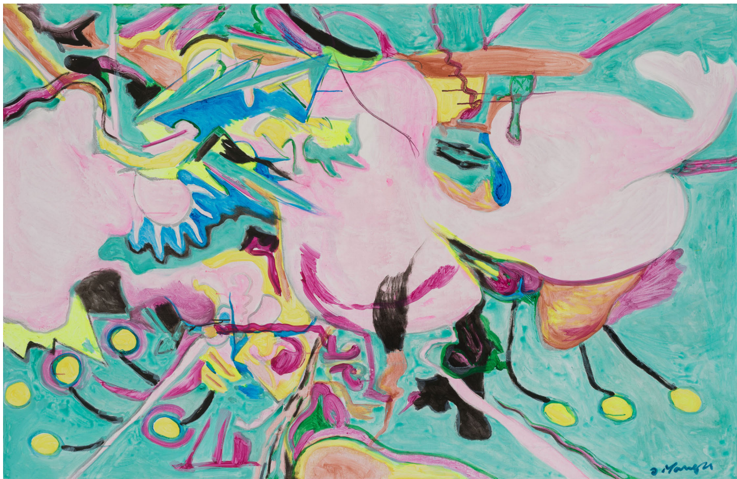
Elephant in the Sky 2022 Acrylic on canvas 1200 x 1800mm