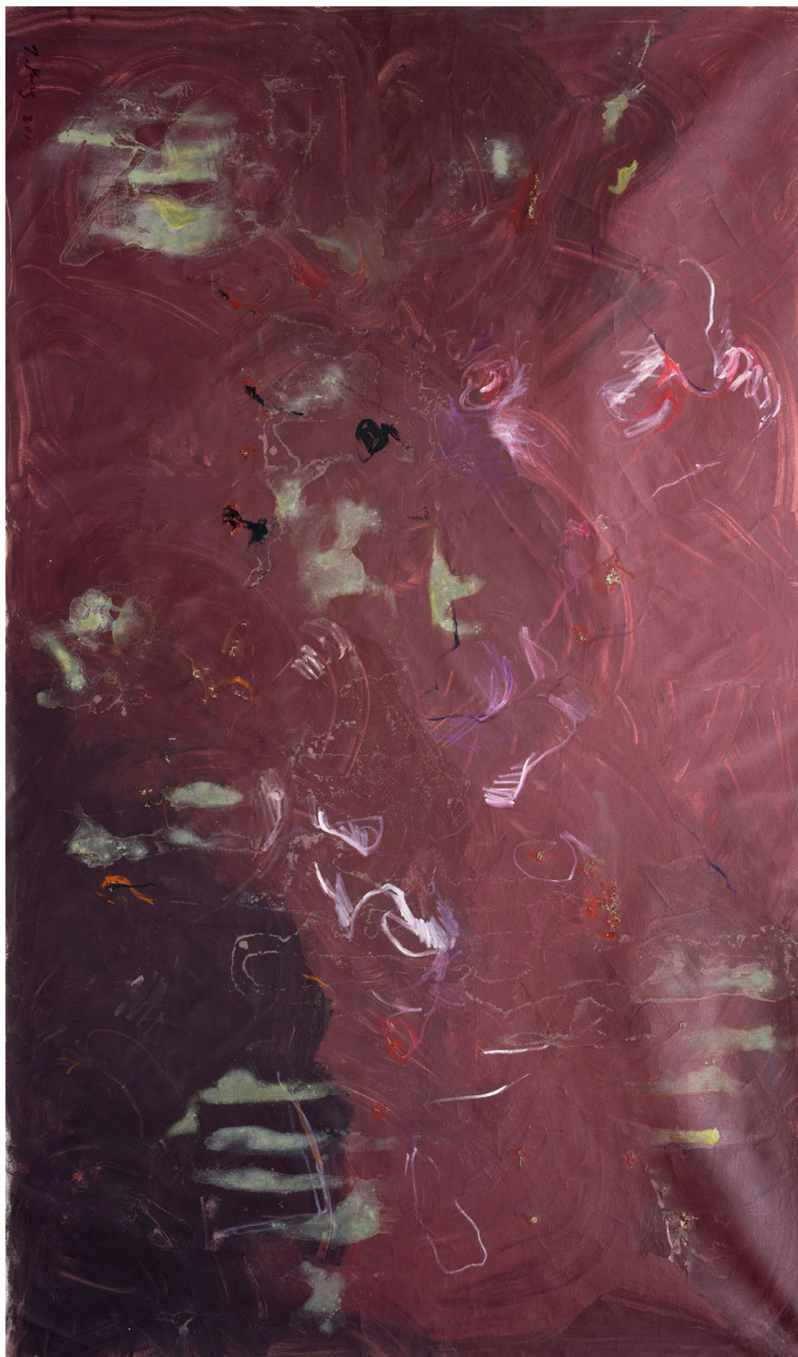
The Painting-Skin (Series)