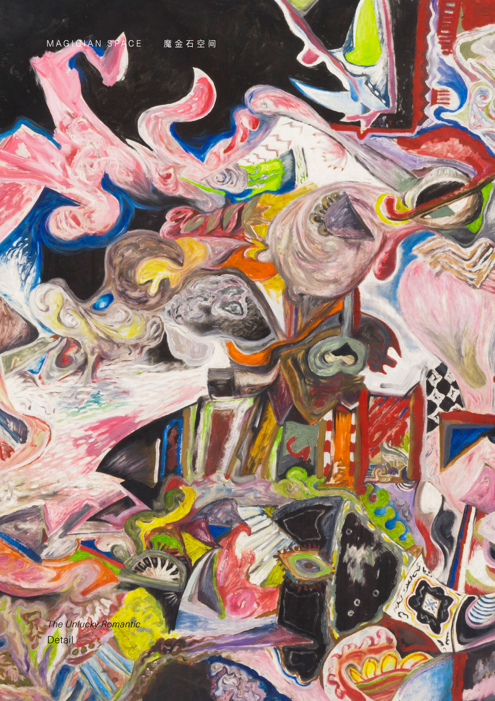
The Unlucky Romantic Detail