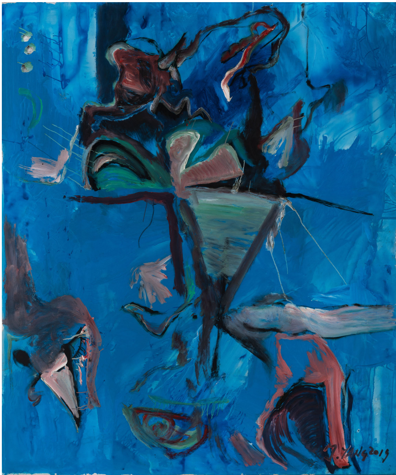
A Cup of Flowers