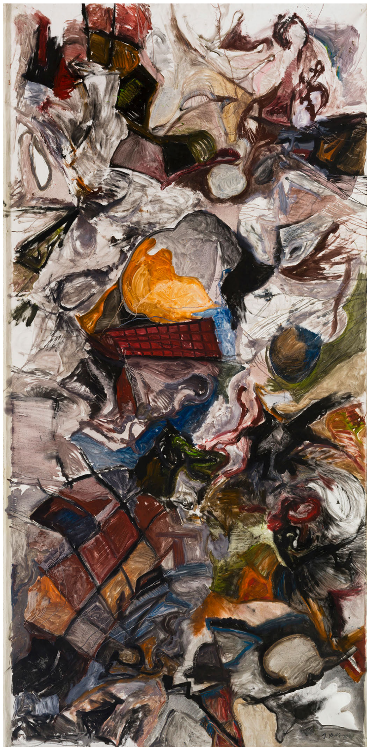
The Painting-Skin (Series)