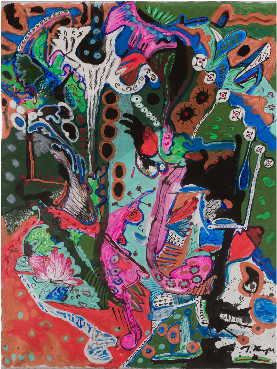
The Merry Snail