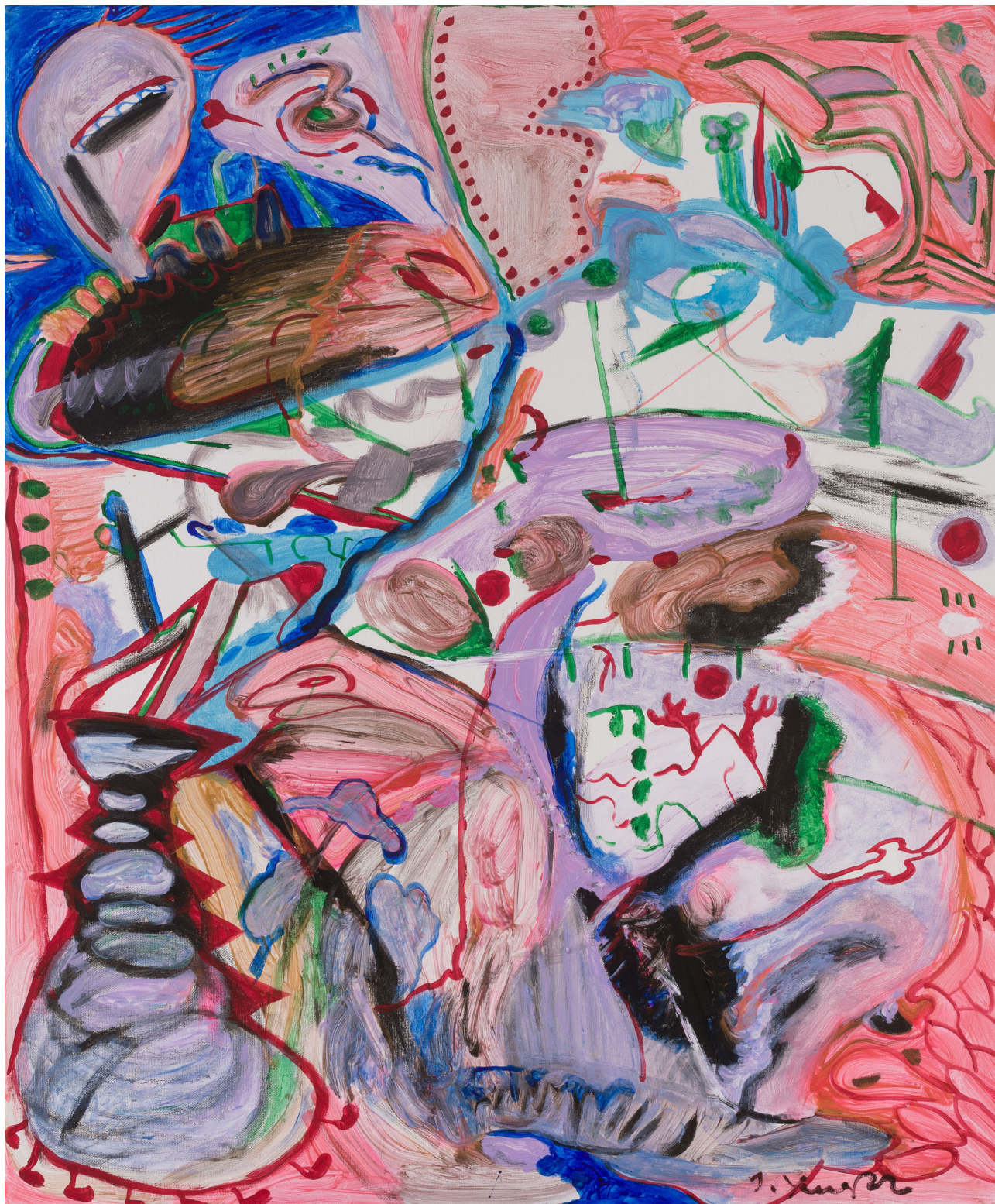
Song of the Oyster