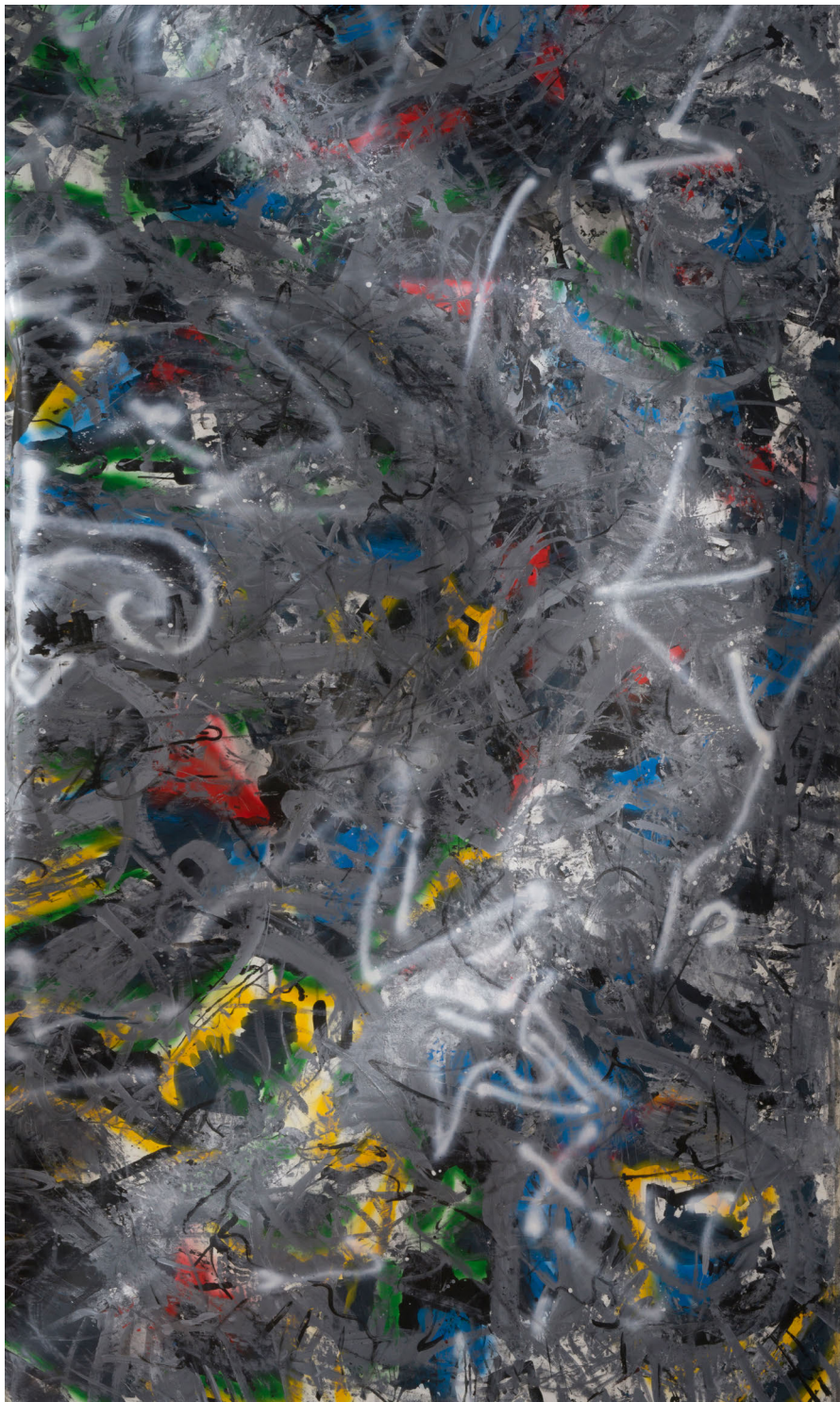
The Painting-Skin (Series)