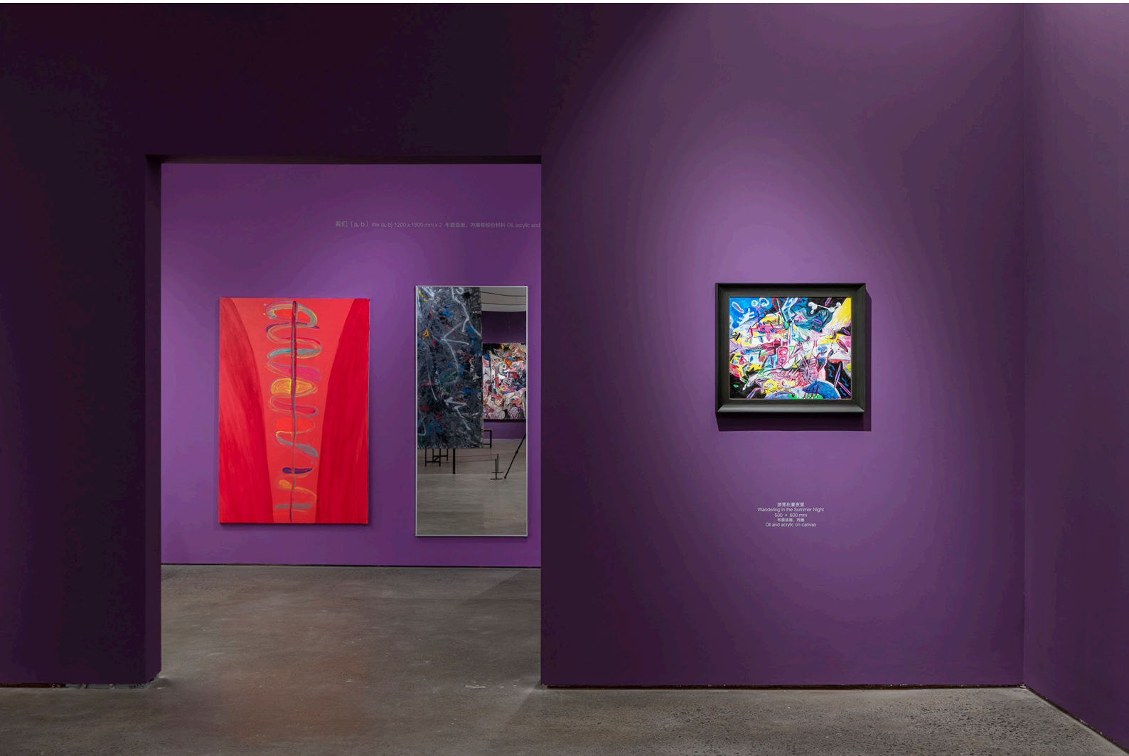
我们 (a, b) We (a, b) 1200 x 1800 mm x 2 布面油画, 丙烯等综合材料 Oil, acrylic and