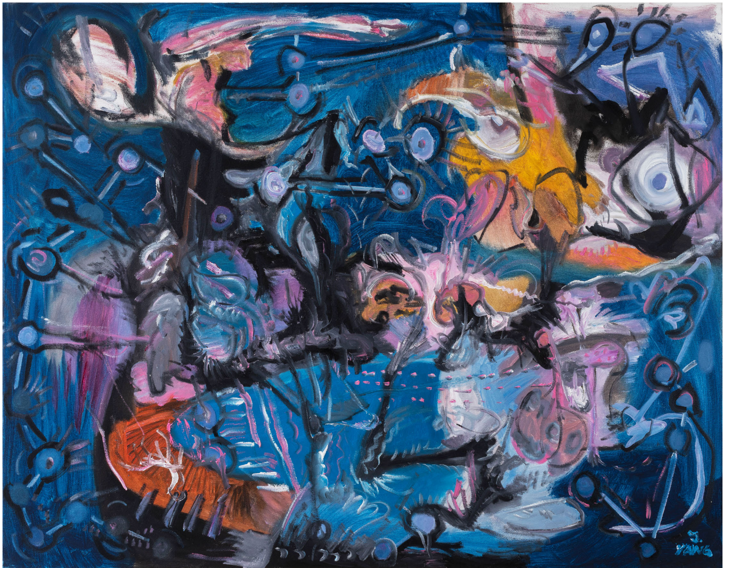
Divine Comedy A 2021 Oil on canvas 1000 x 1300 mm