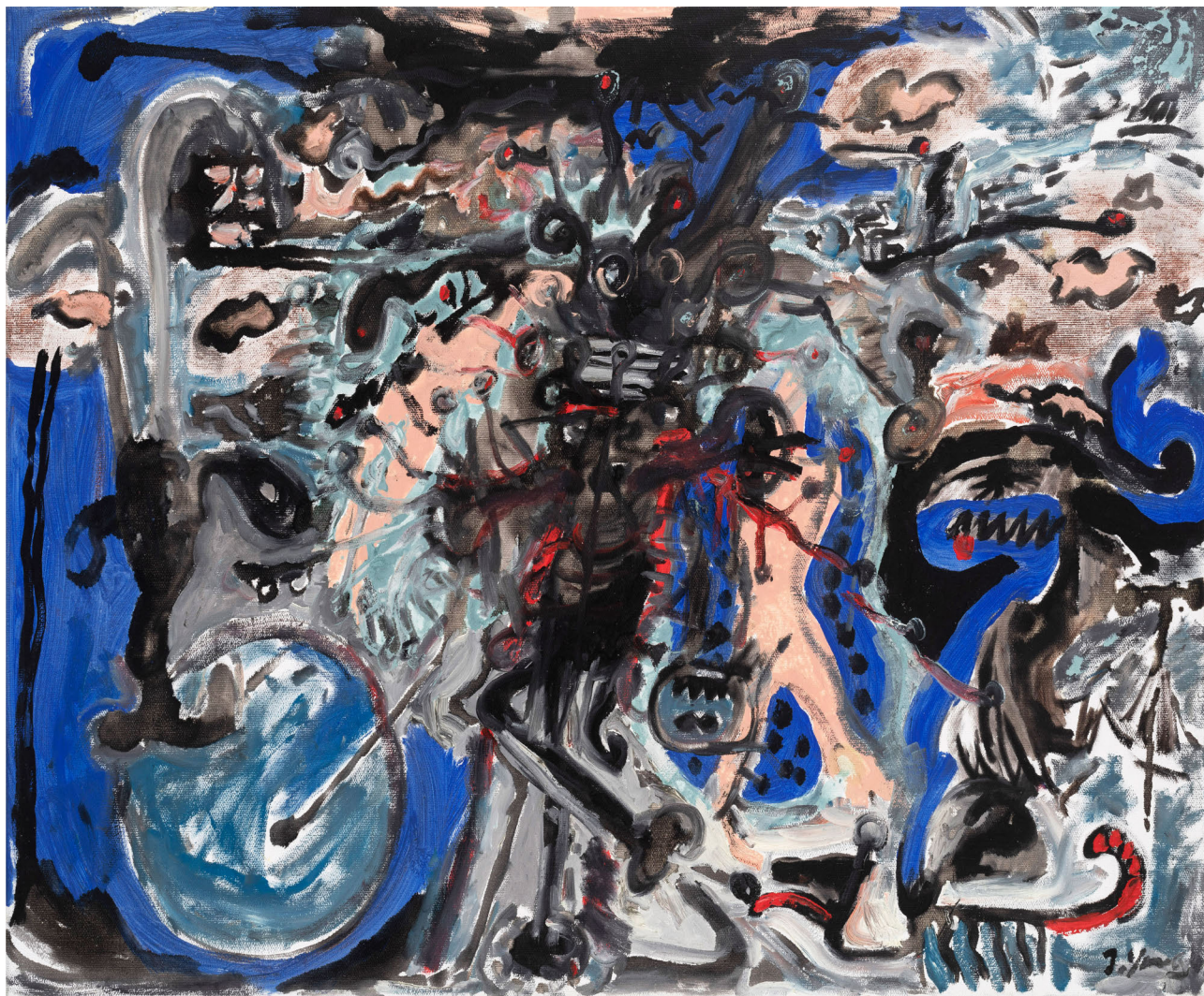
Pet & Monster