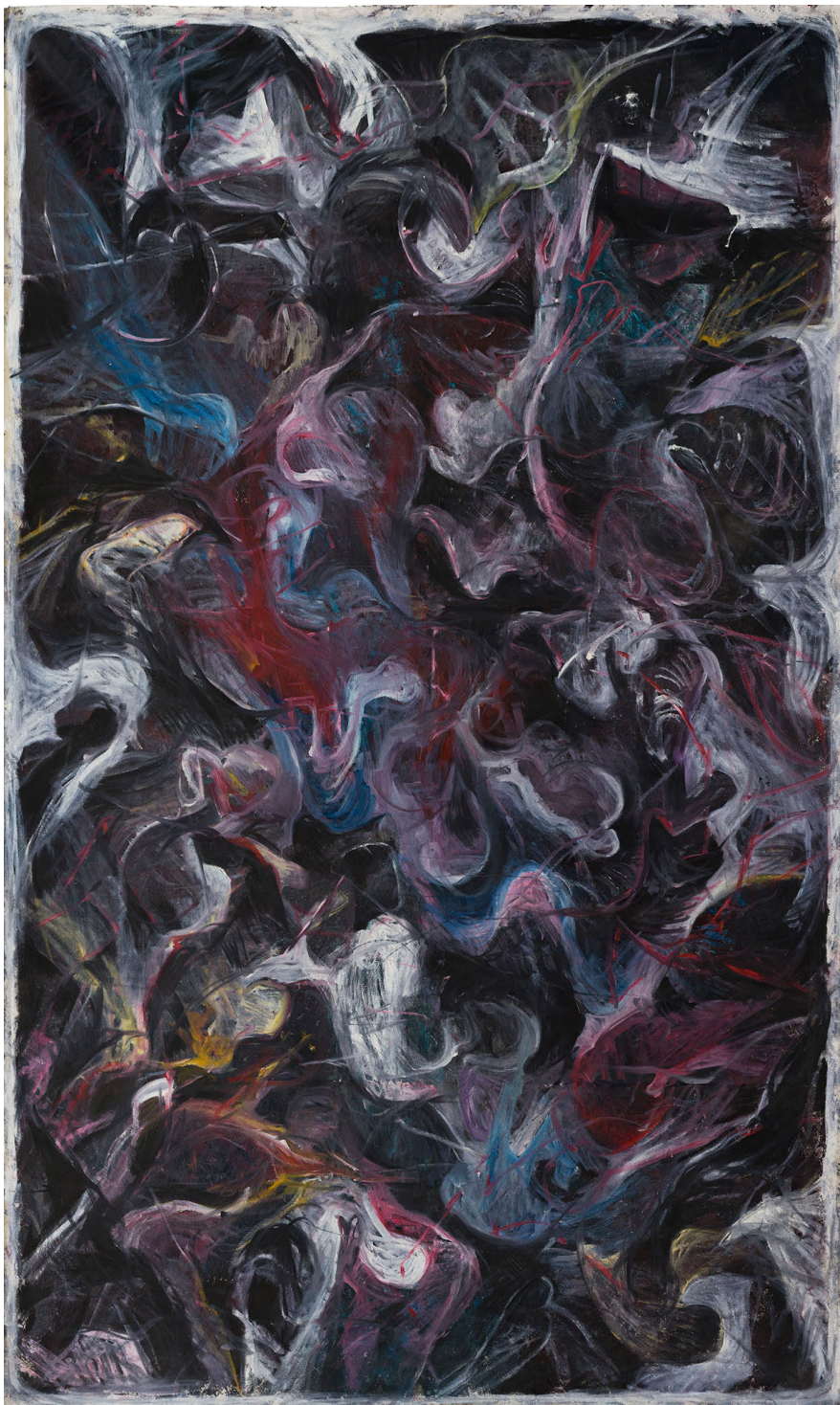
The Painting-Skin (Series)