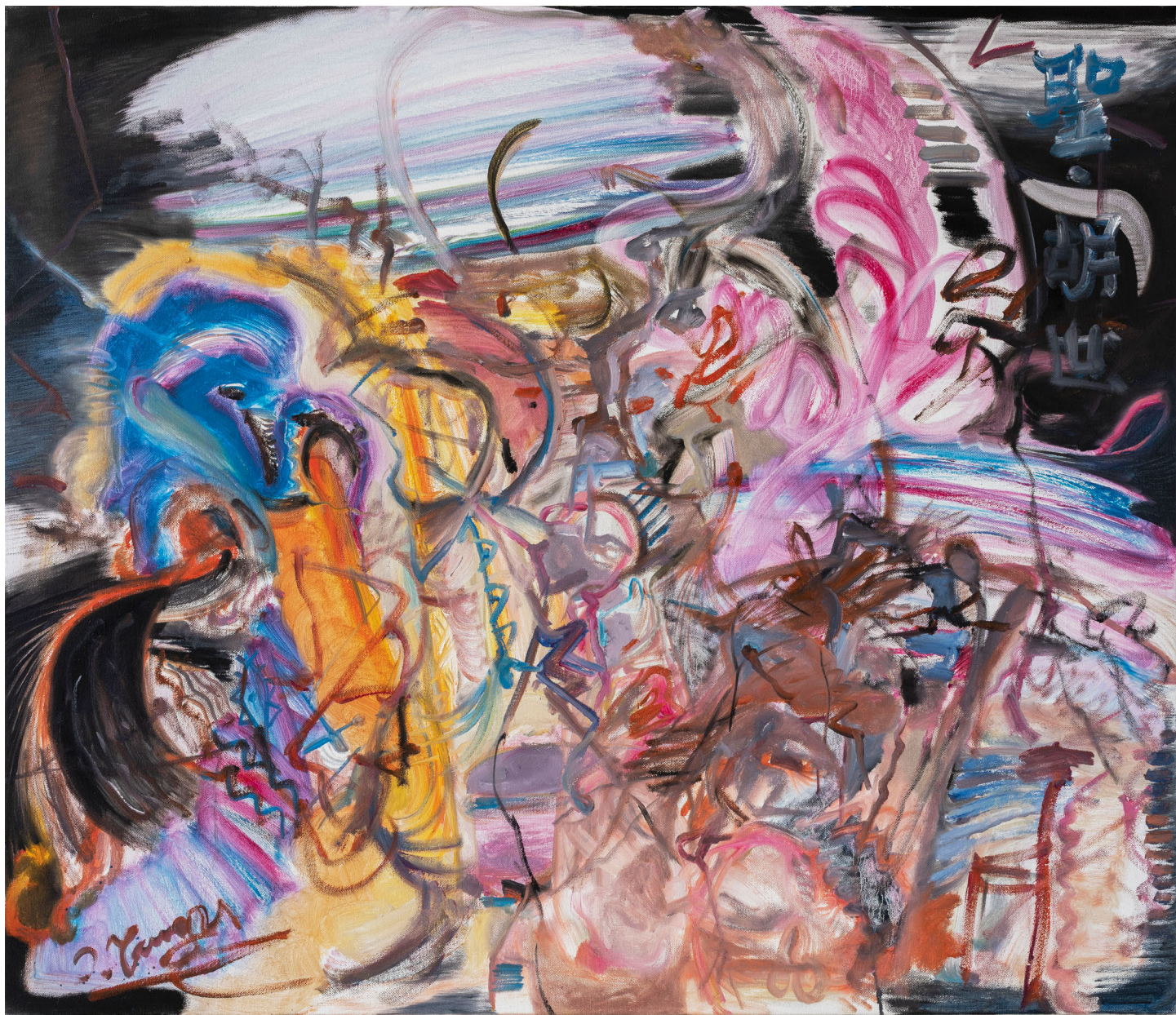
St. Hushi Street 2021 Oil on canvas 1000 x 1300 mm