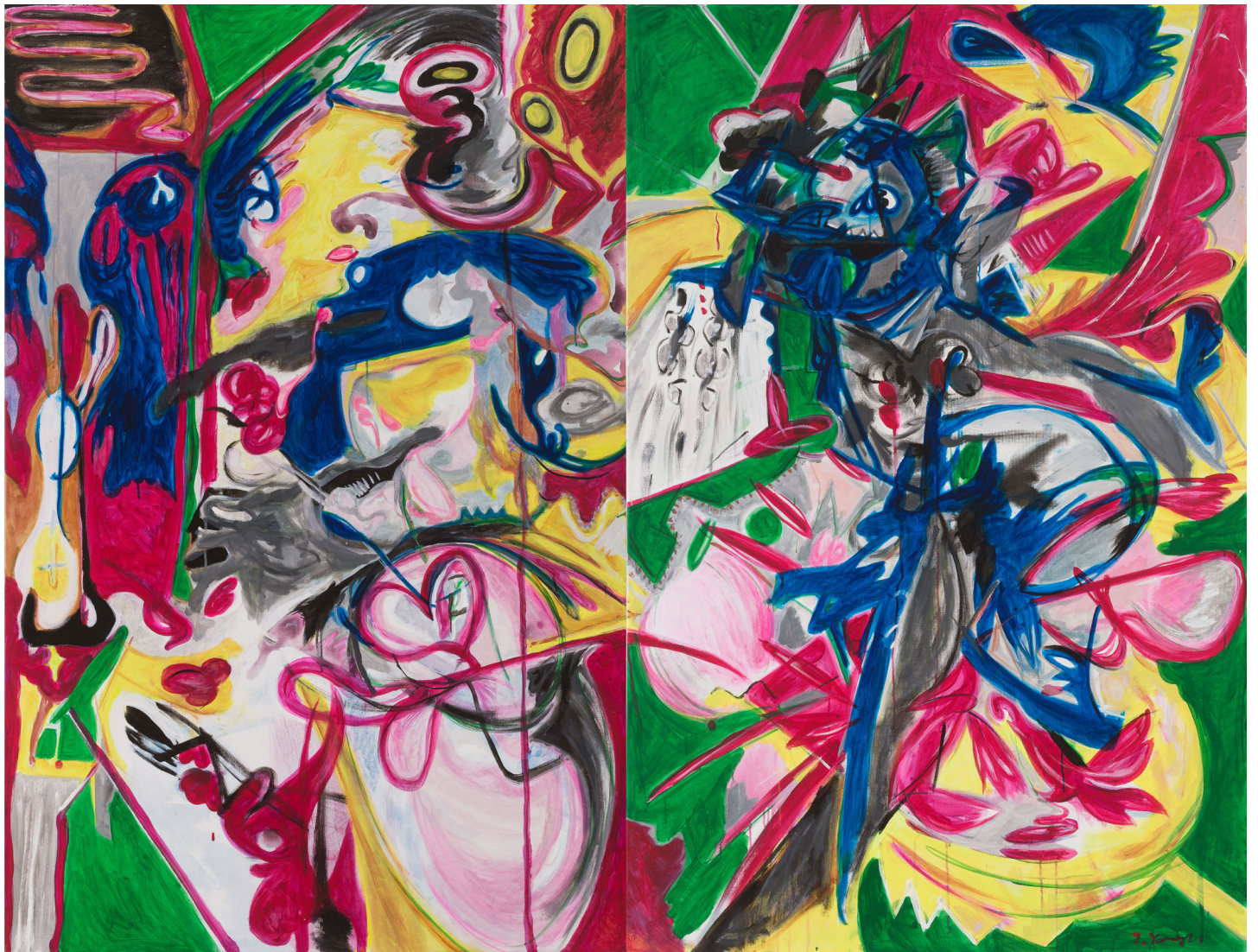
The Flowers of Evil