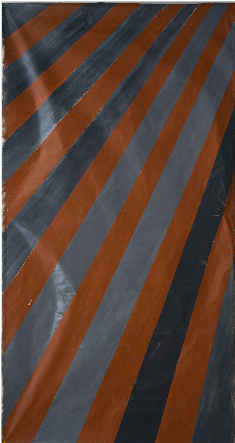
The Painting-Skin (Series)