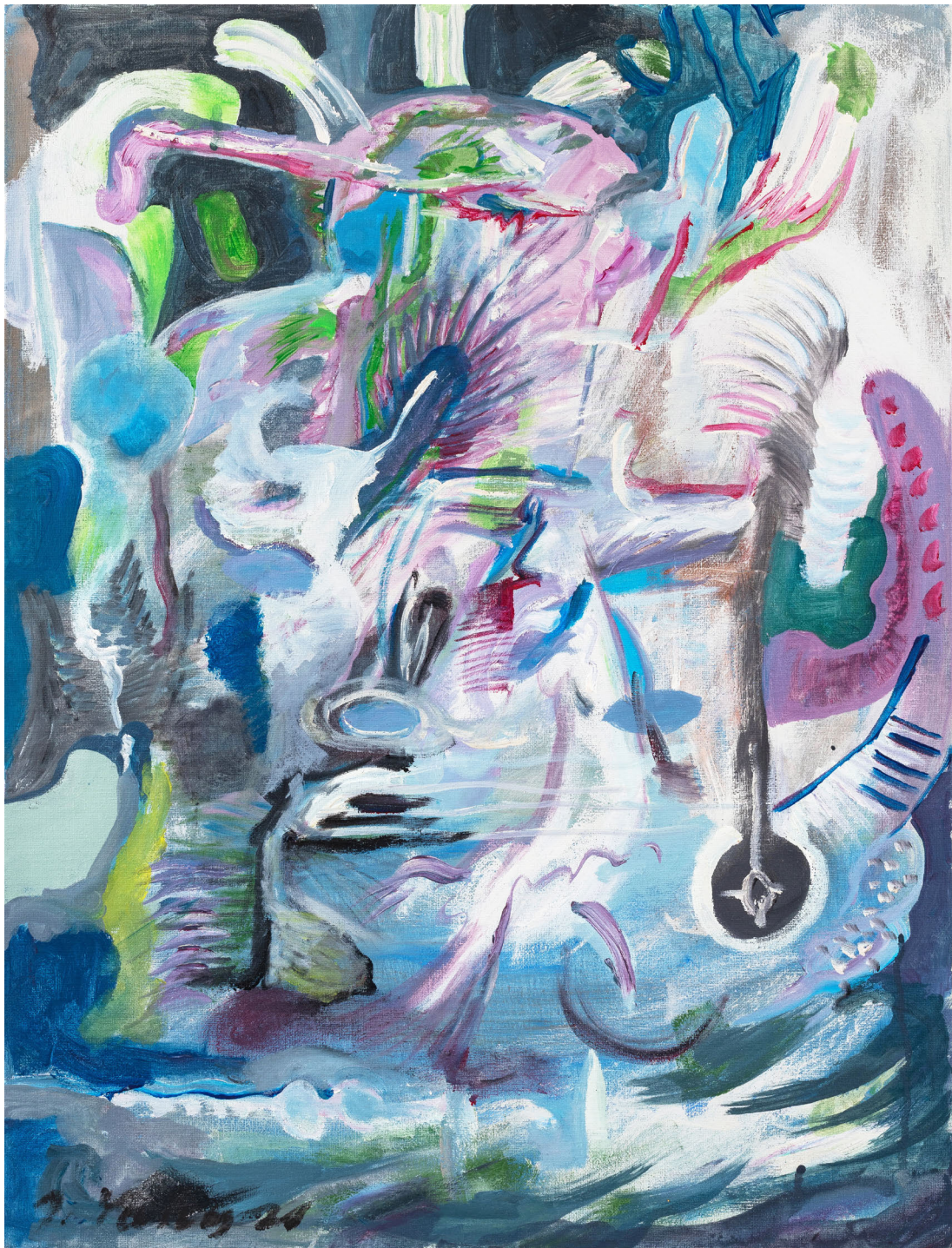
The Scorch theory