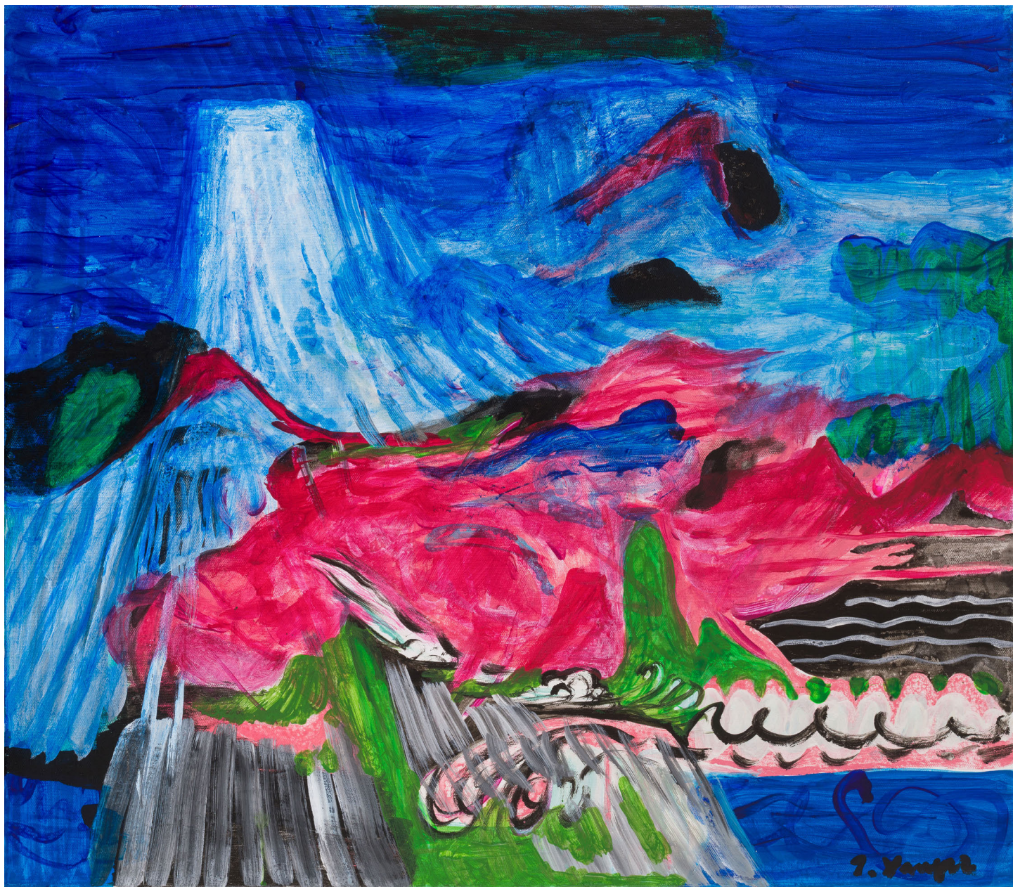
The Holy Mountain No.1 2022 Oil and acrylic on canvas 700 x 900 mm