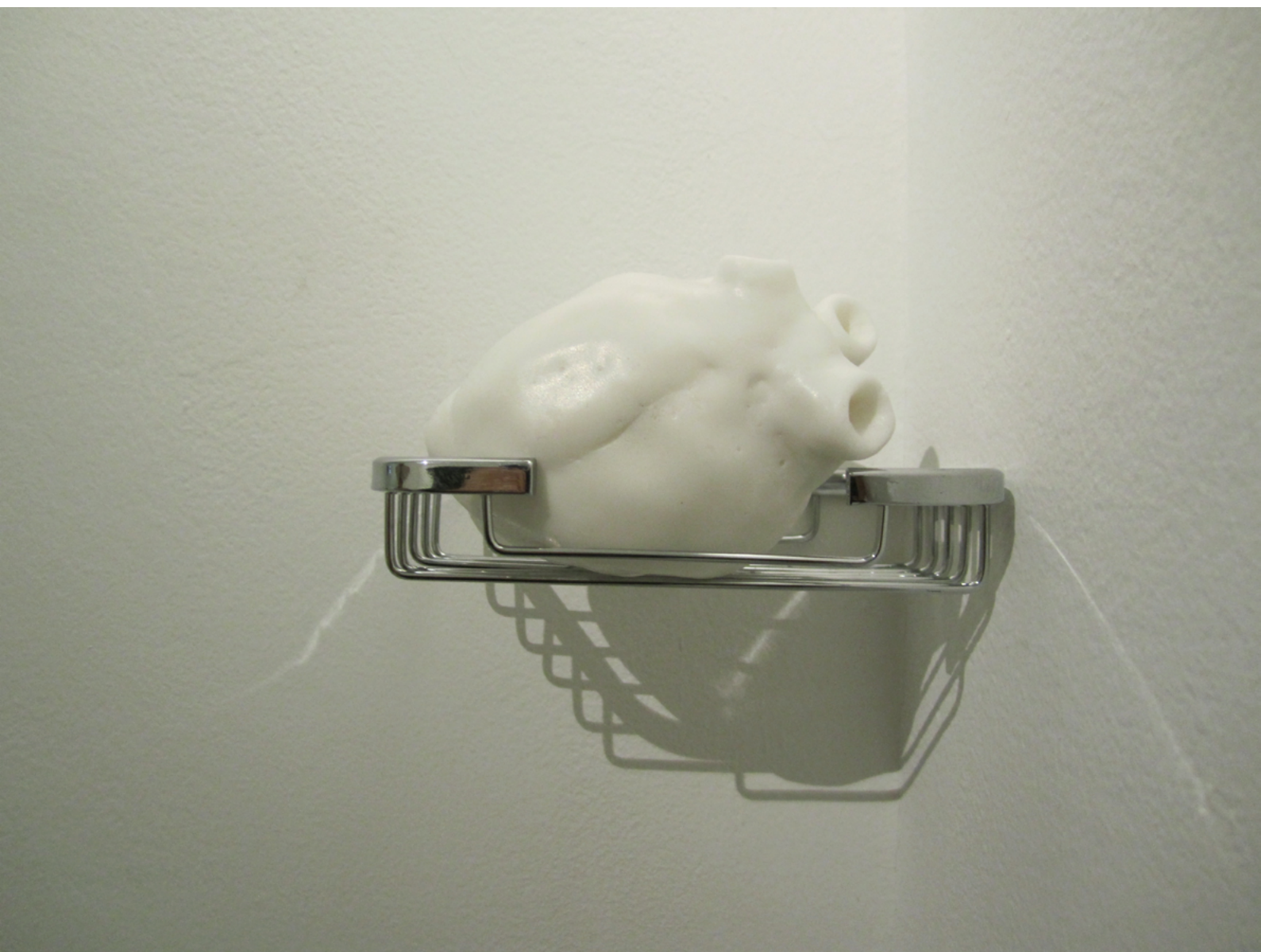
Gao Weigang | Exhaustion 2010 Installation Soap