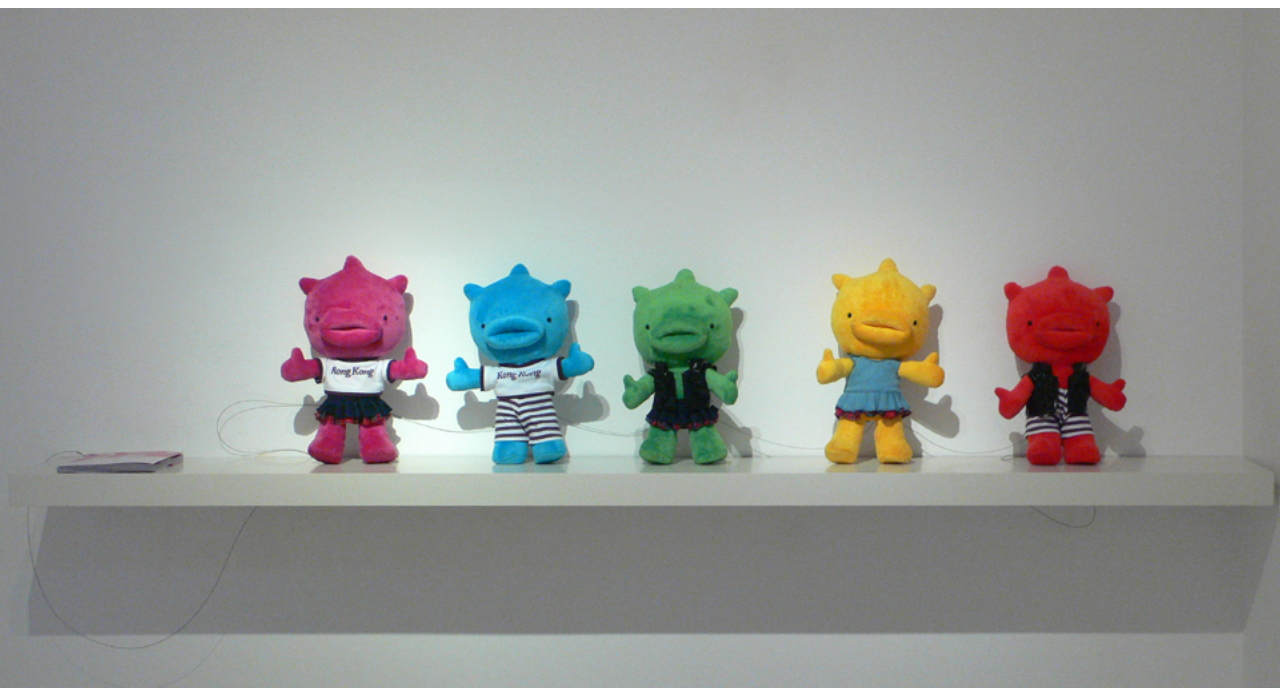
Xiong Wenyun | Kongkong 2010 Installation Toys 30cm (H)