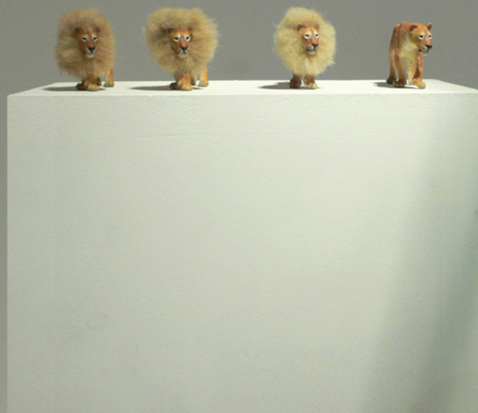
Ren Cheng | The Lion is Coming 2010 Installation Dog hair (Chow chow), toys, glue 15 x 4 x 8 cm